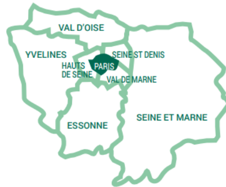
Paris and Île-de-France

Paris is the world's number ONE TOURIST DESTINATION